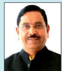
Shri Pralhad Joshi Hon'ble Minister of New and Renewable Energy, Government of India