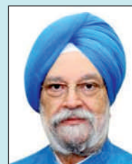
Shri Hardeep Puri Union Minister of Petroleum and Natural Gas, Government of India