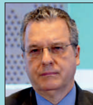
H.E. Mr. Kenneth Felix Haczynski da Nóbrega, Ambassador of Brazil to India

The Inaugural ceremony was led by the Chief Guest Shri Nitin Gadkari, Hon'ble Minister of Road Transport & Highways, Government of India in the presence of Shri Manjinder Singh Sirsa, Hon'ble Minister of Industries, Food & Supplies and Environment, Forest & Wild Life, Government of NCT of Delhi, emphasized the critical role of bioenergy in India's sustainable future. The following dignitaries were also present on the occasion: