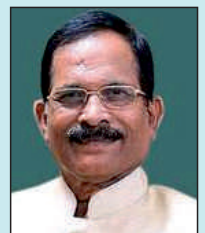
Shri Shripad Naik Hon'ble Minister of State for New and Renewable Energy, Government of India

featured over 30 sessions covering diverse topics such as compressed biogas, ethanol, sustainable aviation fuel, and green hydrogen, offering a glimpse into the future of sustainable energy solutions.