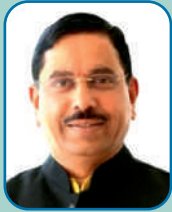
Shri Pralhad Joshi Hon'ble Minister of New & Renewable Energy & Consumer Affairs, Food and Public Distribution, Government of India

India Bioenergy and Tech Expo 2025 reflects a strong, futuristic vision for the bioenergy sector. I appreciate the efforts for bringing the entire ecosystem under one roof. I am sure the collaboration, innovation, and research will inspire India's society and industry toward a sustainable bioenergy-driven future.