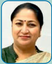
Smt Rekha Gupta Hon'ble Chief Minister, Government of Delhi

India Bioenergy and Tech Expo 2025 reflects the inclusive growth while showcasing India's rising clean-energy momentum. With strong farmer-industry participation, Phase-II of the National Bioenergy Program will expand budgets, strengthen R&D, and boost indigenous manufacturing.