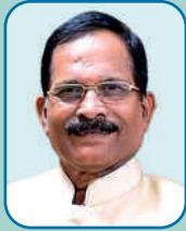
Shri Shripad Naik Hon'ble Minister of State for Power and New & Renewable Energy, Government of India

India Bioenergy and Tech Expo 2025 reflects a strong, futuristic vision for the bioenergy sector. I appreciate the efforts for bringing the entire ecosystem under one roof. I am sure the collaboration, innovation, and research will inspire India's society and industry toward a sustainable bioenergy-driven