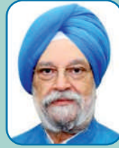
Shri Hardeep Singh Puri Hon'ble Minister of Petroleum and Natural Gas, Government of India

India Bioenergy and Tech Expo 2025 is a platform which unites innovators, strengthens India's renewable energy mission, and drives the initiative for a sustainable, self-reliant energy future. I believe the participants will be benefited from this initiative and upcoming editions also.