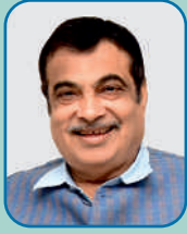
Shri Nitin Gadkari Hon'ble Minister of Road Transport and Highways, Government of India Patron, IFGE

India Bioenergy and Tech Expo 2025 reflects a strong, futuristic vision for the bioenergy sector. I appreciate the efforts for bringing the entire ecosystem under one roof. I am sure the collaboration, innovation, and research will inspire India's society and industry toward a sustainable bioenergy-driven future.