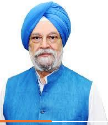
Shri Hardeep Singh Puri

Hon'ble Minister of Petroleum and Natural Gas Government of India