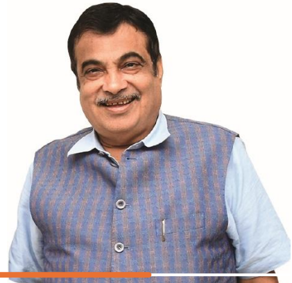
Shri Nitin Gadkari

Hon'ble Minister of Petroleum and Natural Gas Government of India