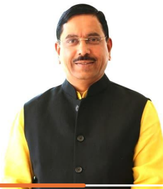
Shri Pralhad Joshi

Hon'ble Minister of New and Renewable Energy, Consumer Affairs, Food and Public Distribution Government of India